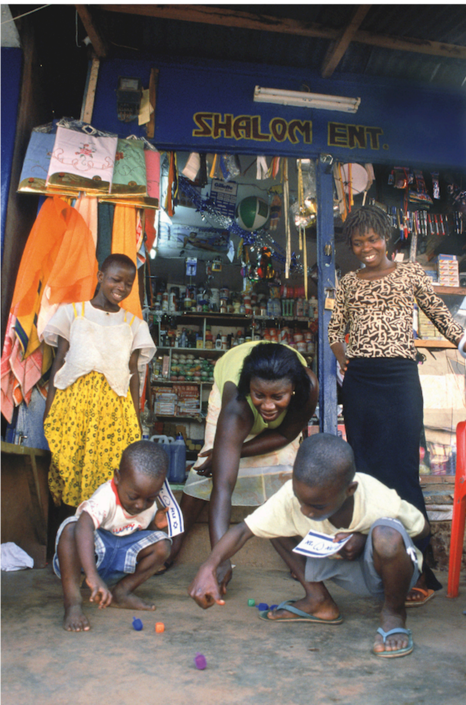
Reprinted with permission.